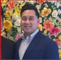
SOK HING COUNSELOR