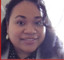
SILOTOI TI STUDENT PROGRAMS SPECIALIST